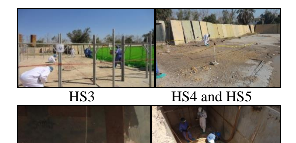
HS6 system6100 Figure (2) the affected area

The research has done in Radioisotopes Production Laboratory (RPL) which is located at Al-tuwaitha nuclear site. It used to produce the radioisotopes kits for medical and industrial uses after being irradiated in IRT-5000 reactor [9]. The decission was taken to decommission the facility part of as a Iraqi Decommissioning Project and the work began in 2010 and finshed in 2014. The surface contamination is found during decommissioning of RPL. The affected area accupied 600m^2 and laid out in five hot spots (figure 2) HS3, HS4, HS5, HS6 and system 6100. The contaminated materials in the affected area are soil and debris [10].